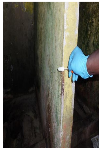
A public toilet wall being swabbed for laboratory testing.

lets were tested for fecal contamination. In addition, a survey was conducted in 800 households to ascertain latrine conditions. A similar survey was carried out in nurseries, primary schools and public toilets.